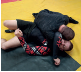
Arm-in choke- Arm triangle choke.