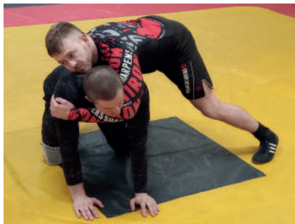
Arm across the throat.