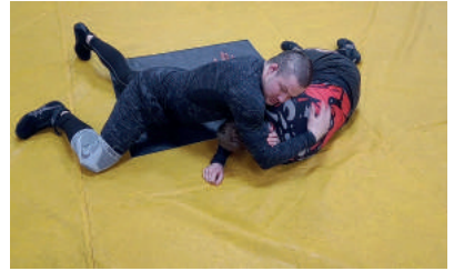
Arm-in choke-D'Arce choke.